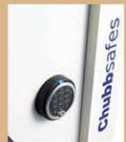
c) Z03 Digital Combination Lock, listed under UL Type 1. ( Power Source 1 unit of 9V size battery ) Furniture Projection: 38mm