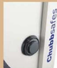
b) 3-wheel Keyless Combination Lock only, listed under UL Group 2. Furniture Projection: 30mm