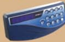
Electronic Lock Furniture Projection: 30mm