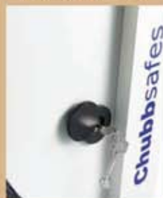
a) 8-lever double bitted Key Lock only, certification under UL 437. Furniture Projection: 27mm